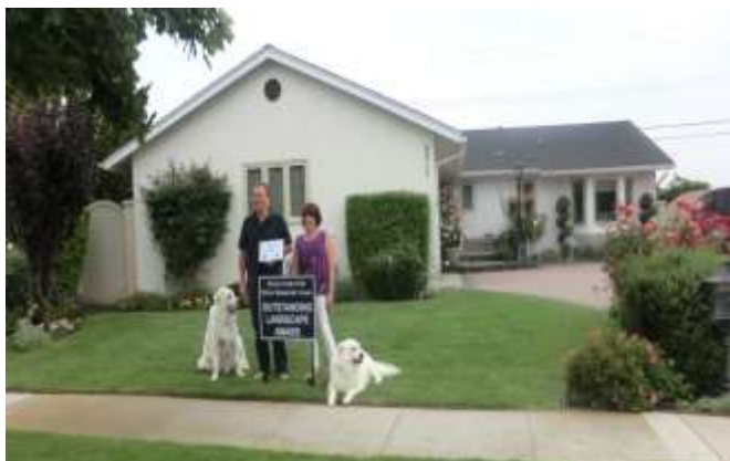
July 2013—The Montelongo Residence—4817 Paseo de las Tortugas

The Montelongo's trim and charming ranch house highlights a lush green lawn and whimsical topiaries alongside the front window. A tall porch street light features hanging flower baskets, while a bower vine curves over the garage door. Colorful white and orange roses frame the inviting landscape.